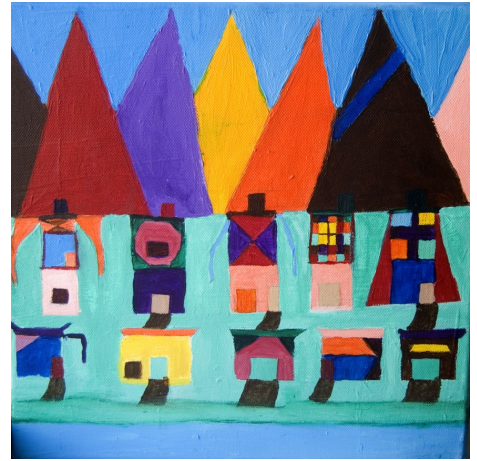
Cubicles By: Hilda Cotta